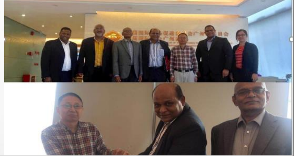
SLCBCC at CCPIT Chengdu