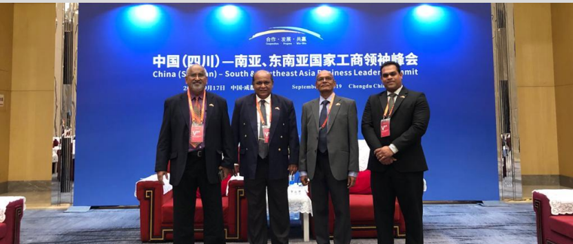
South East Asia and South Asia Business Leaders Summit - Sichuan