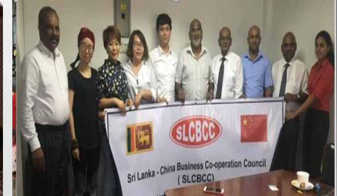
Delegation from Jilling