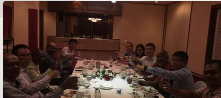
Meeting & Dinner with the Commercial Counselor's Office