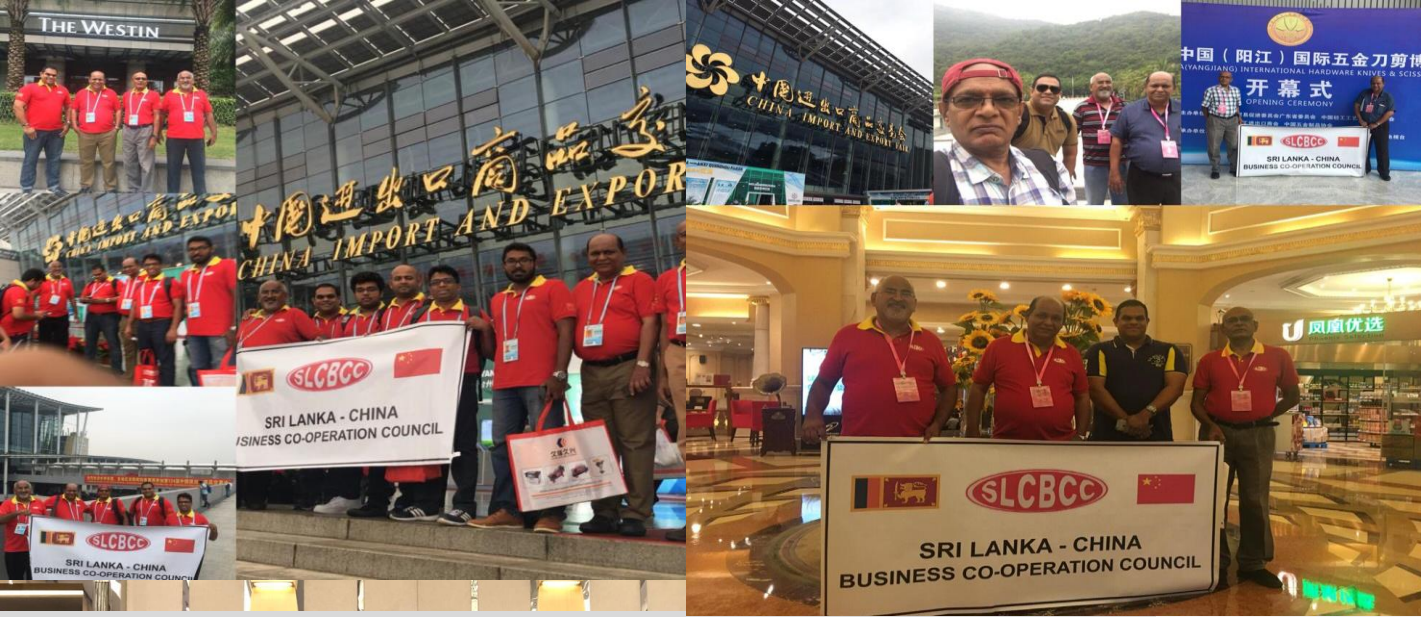
Canton Fair tours