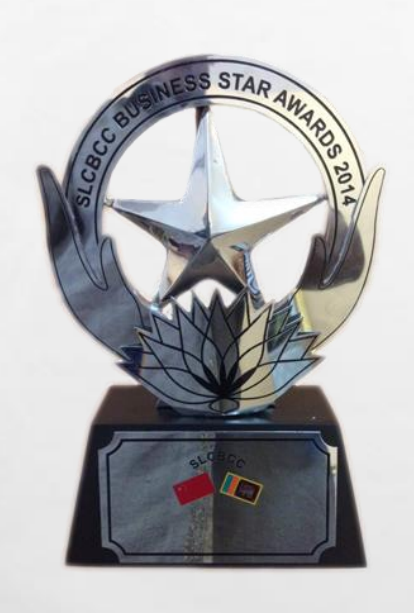
Silver / 銀