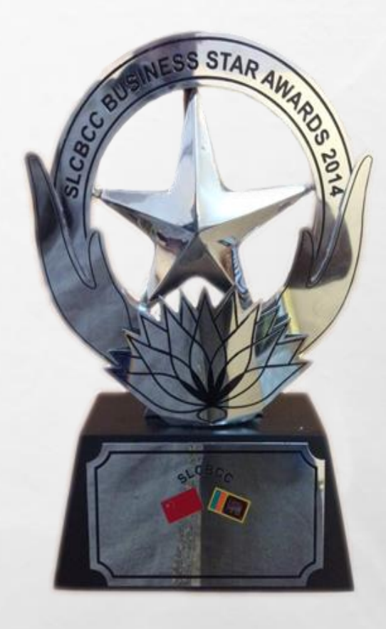
Pinnacle Award 品尼高獎