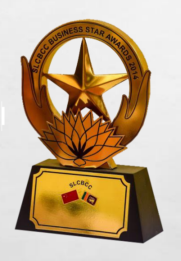
Bronze / 青銅